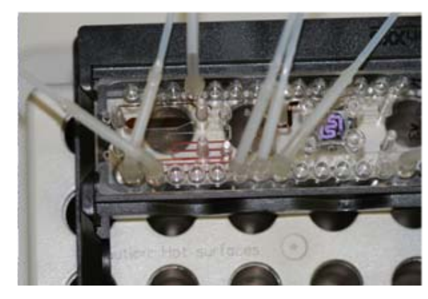
The slide with fluidic connections for sample insertion, lysis buffer and wash buffers.